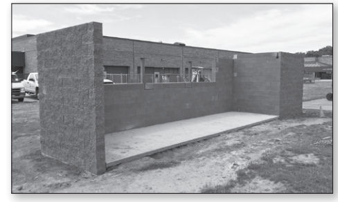
Dugout – The new dugout at Warren Woods-Tower High