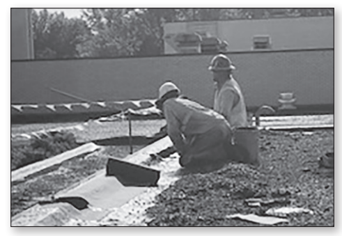
ECC Roof – Contractors continue their work on the roof at the Early Childhood Center.