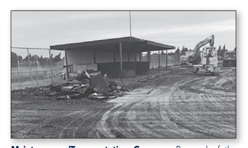
Maintenance /Transportation Garage – Removal of the existing asphalt at the Maintenance/Transportation Garage.

Again, thank you for your continuing support. For a complete list of projects, please visit our website at http://www.warrenwoods.misd.net/2017-bond-progress/ We will continue to keep our promises as additional bond work is completed. You can count on it because in Warren Woods we make it happen together!