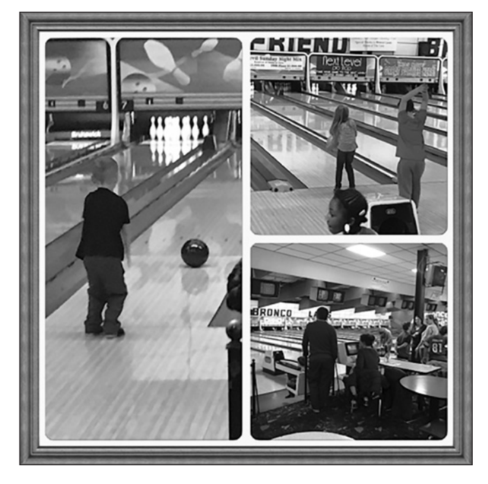
Title I Family Engagement Bowling Event. Families were able to participate in a fun filled evening with friends and families from all three elementary buildings.