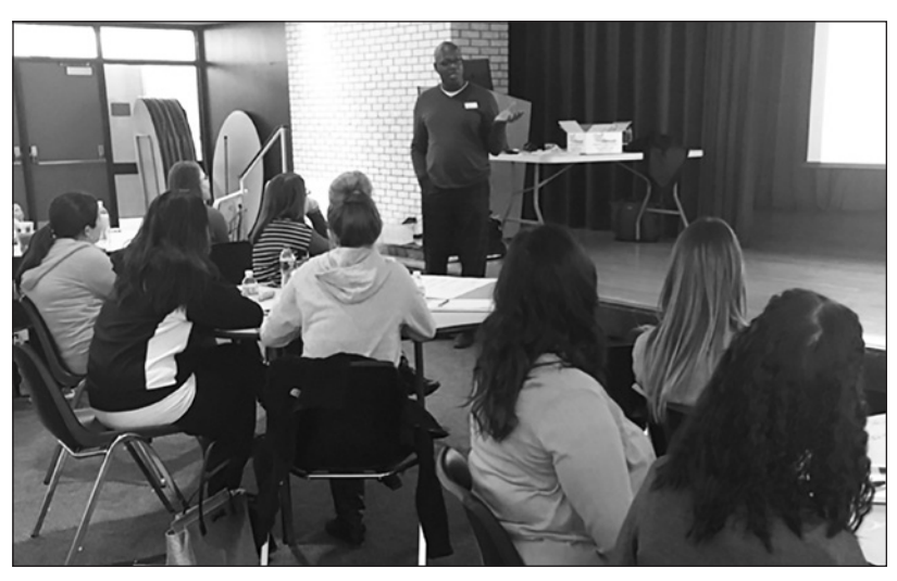
Preschool staff members were able to participate in a HighScope Training due to a grant received.