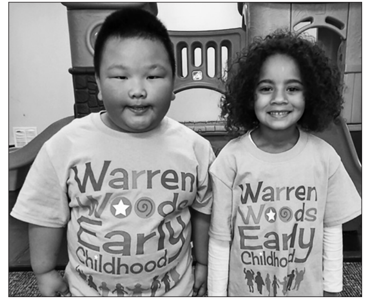
The Warren Woods Early Childhood Center loved the t-shirt fundraiser.