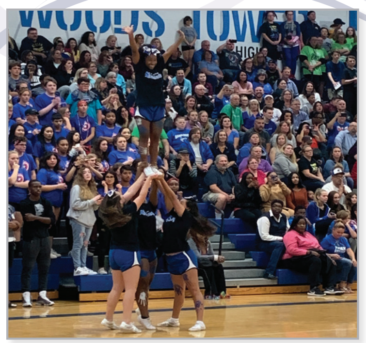
Pep Rally – WWT Cheer Team