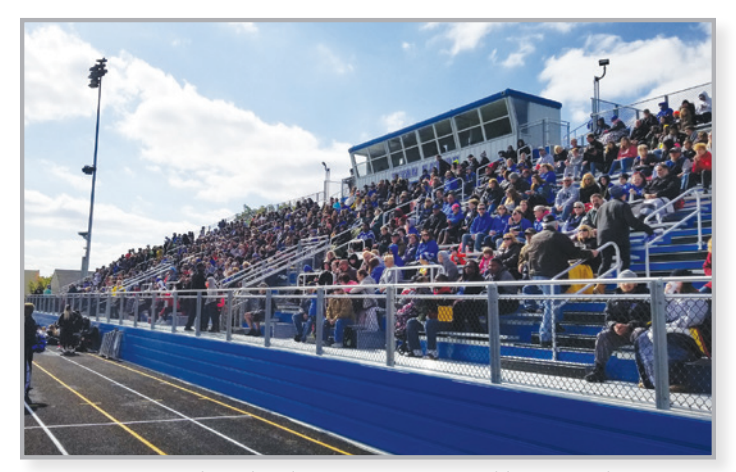
New Grandstand and Press Box at WWT Athletic Complex