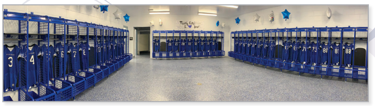
WWT Team Room