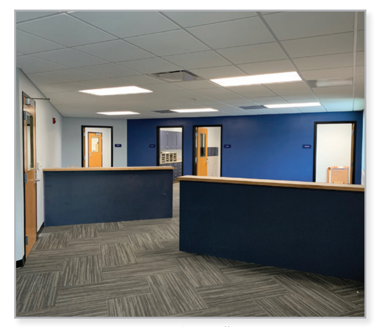
Pinewood Front Office