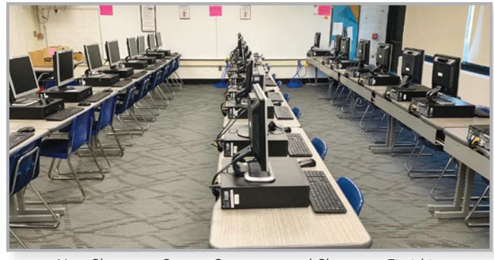
New Classroom Carpet, Computers and Classroom Firnishings