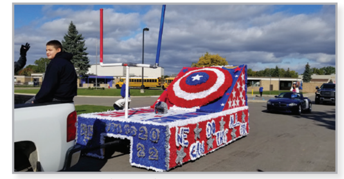
Sophomore Float – Captain America