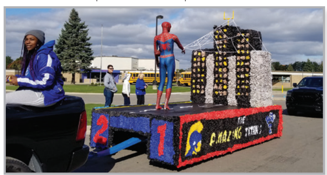
Junior Float – The Amazing Spiderman