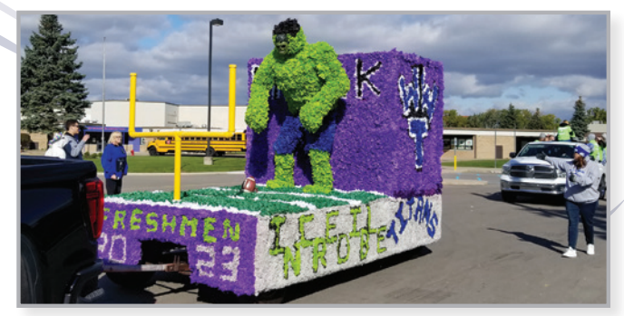
Freshman Float – The Incredible Hulk