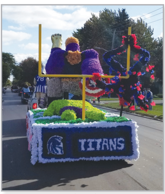
Senior Float – Thanos