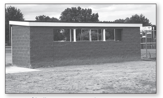
WWT Softball Dugout Painted