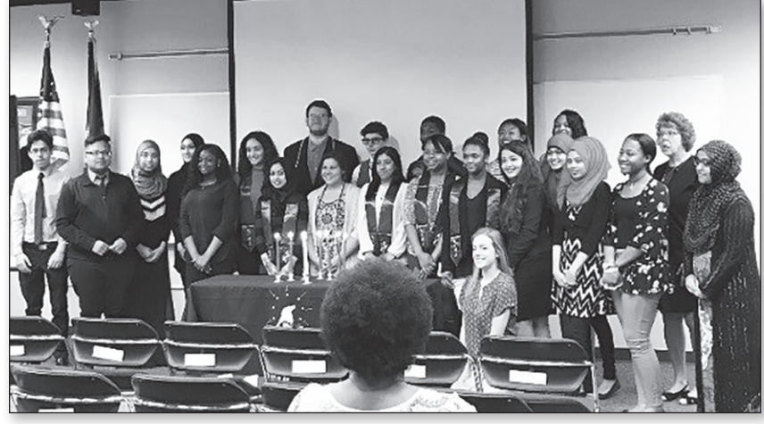
Congratulations to the new NTHS (National Technical Honor Society) Members who were inducted at the annual Induction and Award Ceremony!