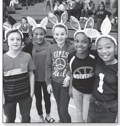
6th Graders are all "ears" at the Pep Rally