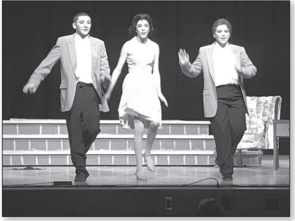
Middle School Students perform in "Singing in the Rain"