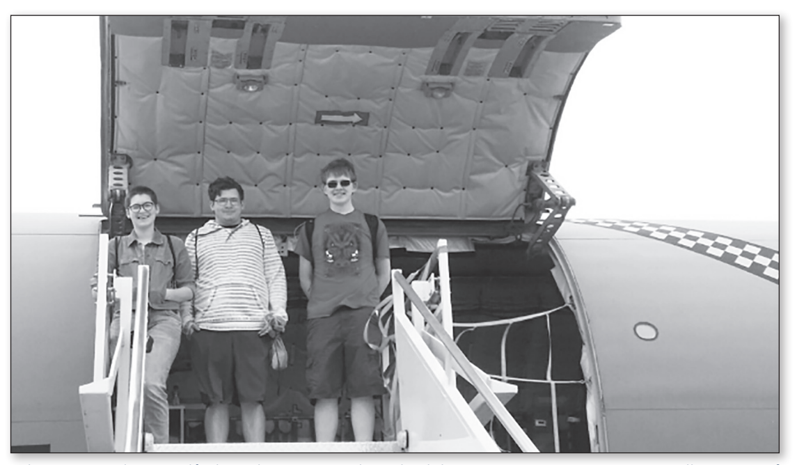
What a great day at Selfridge where our students had the opportunity to experience all aspects of engineering, robotics and flight simulation. Thank you to our SMTEC advisors for sorting through the paperwork to get our students and adults "military approved" to visit Selfridge.