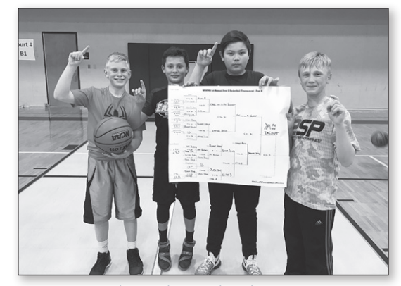
6th & 7th Grade Champs

This year marked the 1st WWMS 3-on-3 Basketball Tournament. The event was enjoyed by students, staff and parents. WWMS hopes to make the 2nd Annual 3-on-3 Tournament an even bigger success!