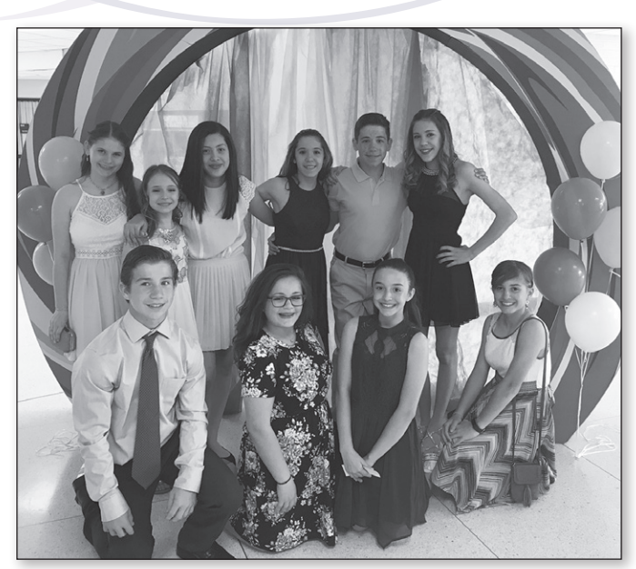
Enjoying a Photo Op!