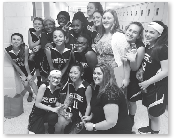
The 8th Grade Girls' Basketball Team is one of many WWMS sports teams that had a successful season!