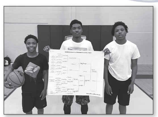
8th Grade Champs