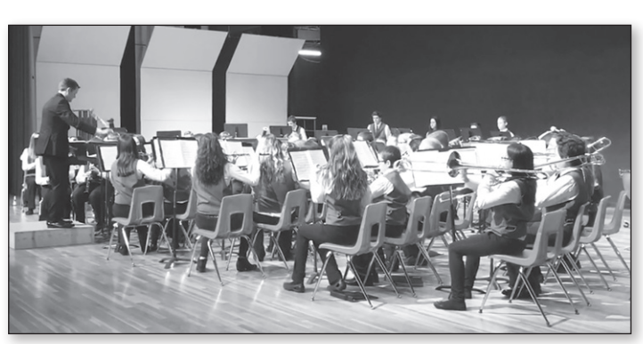
Award-Winning 8th Grade Symphonic Band