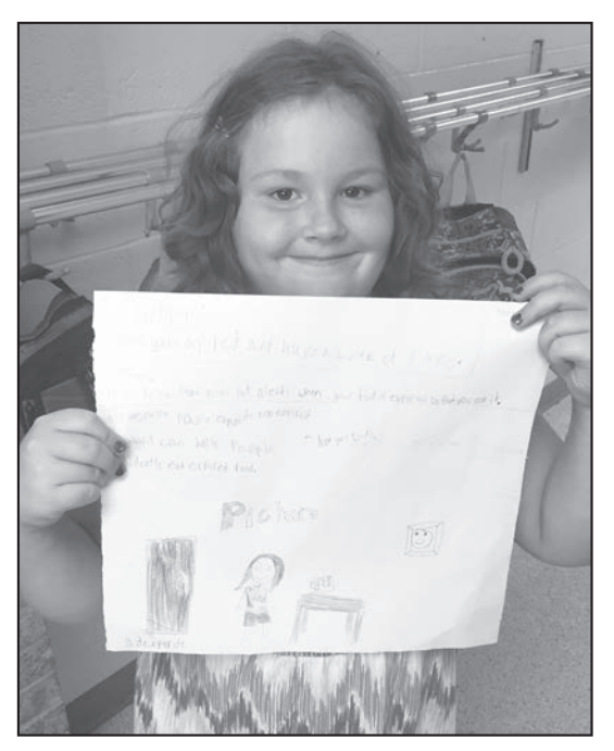
Literacy skills cross all areas of the curriculum. This elementary student showcases writing skills that she applied during summer school.