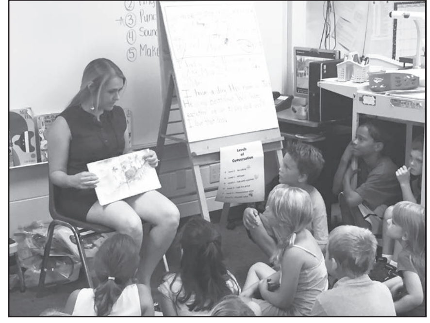
Strengthening literacy skills can take a variety of forms. Students work closely with teachers on whole group and individual proficiencies to take their literacy abilities to the next level.