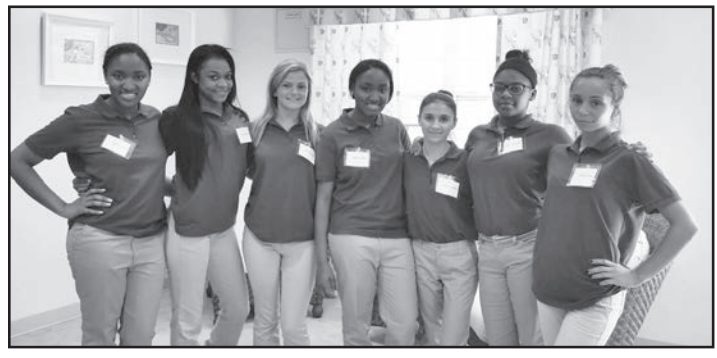
Shelby Crossing Clinicals 2016 - SMTEC