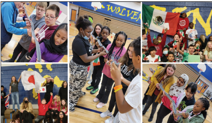
On Friday, November 18, 2022, eligible students participated in our WWMS First Quarter PBIS Incentive – WWMS Olympics!